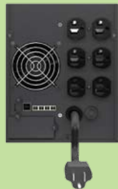
Liebert GXT3 mini-tower model provides 1000VA capacity in a compact design.