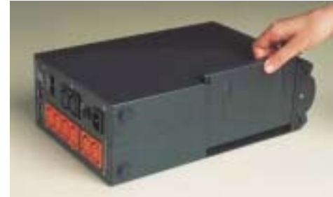
On 650 and 1000VA the Hot Swap slot is located on the bottom of the unit.